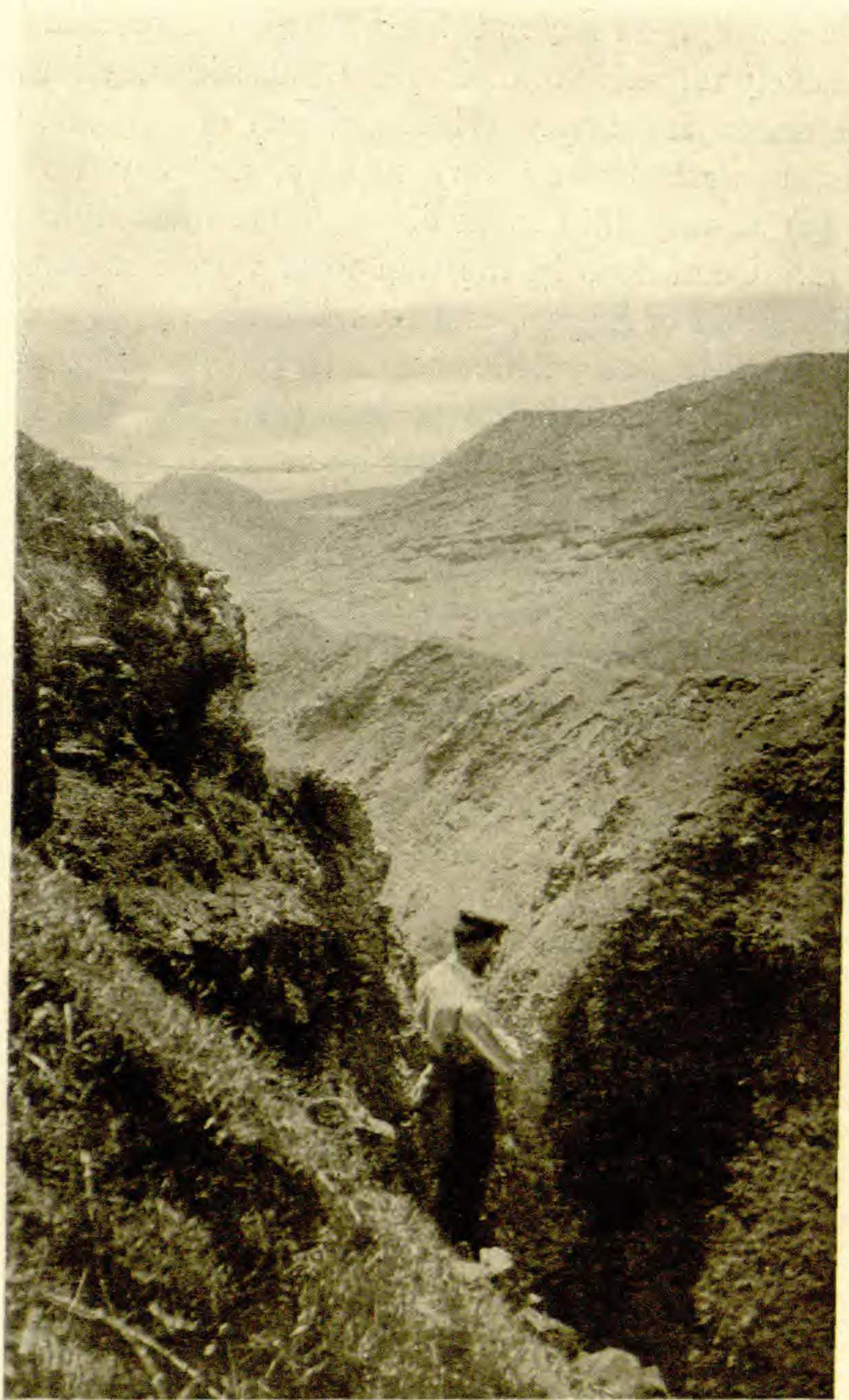
FIG. 6.—Arid ridges and precipices, formerly forested, devastated by goats and cattle ticed eye. These varied hues give to the groves, particularly in the slant light of late afternoon, a rich, mottled, velvety effect, as though the forest were indeed a wondrous woven drapery.

with red, heavy somber green, glossy green, literally scores of subtle and indefinable shades of green are discernible to the prac-